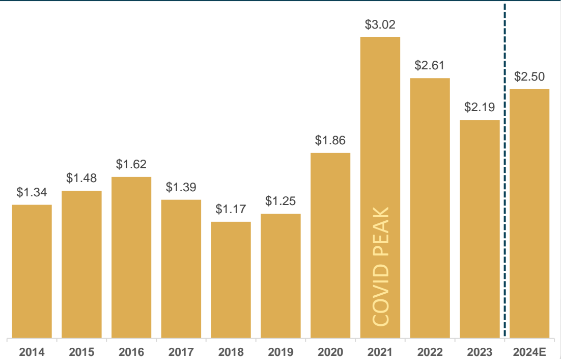
Adjusted Diluted EPS (1)

8.4% Adjusted Diluted EPS CAGR (3) over the last ten years